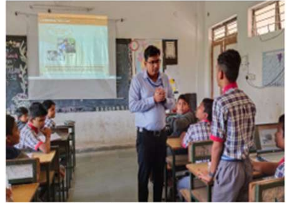
A class observation in progress

The RP observes the class being conducted by the trained teachers and interacts with the students and teachers to understand whether the values of the program have enriched their outlook and whether they find any positive behavioural changes in themselves. In no circumstance does an RP act as an inspector or examiner. Rather, RPs aim to hand hold teachers and reduce their burden. Consequently, the feedback we receive is extremely encouraging and motivates us to go to remote schools despite huge logistical challenges. This free offering of Ramakrishna Mission Delhi-Gurugram, has been lauded repeatedly by teachers, principals, government authorities, parents and children. The demand for ACP in more and more schools has to be met. Hence, committed resource persons/donors who are interested in contributing towards this program may contact us at the email address given below.