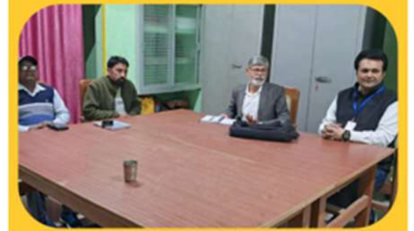
Our implementation team actively interacting with teachers and students on a recent visit to JNV Bulandshahr.