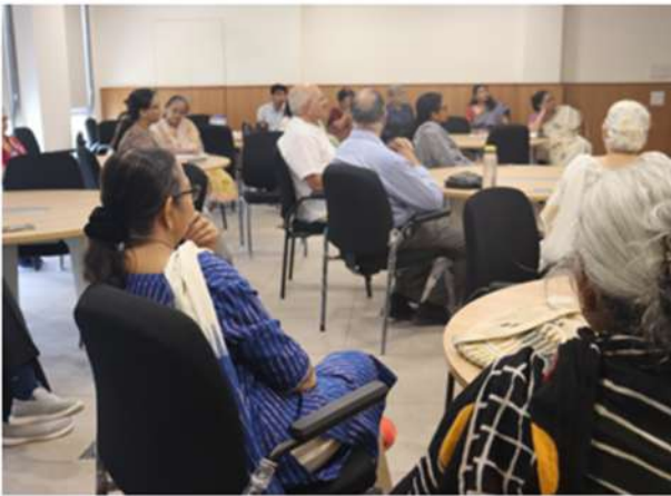
The engaged Svarat group at the workshop

2. The SVARAT offline and informal meeting with VIVA group is held occasionally on a Friday at VIVA. In September, the topic was “Compassionate Communication with Oneself”. The energetic group were very happy to discuss a matter close to their hearts with the facilitators at VIVA who in turn were happy to share their own experiences in this regard.