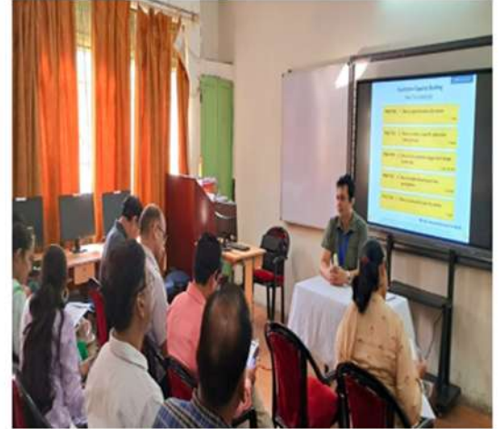
From the ACP training in Chandigarh

Offline trainings for the 3 years of ACP were held at Dehradun and Chandigarh for the Kendriya Vidyalaya schools. The excellent facilitators from VIVA led the teachers through the various modules that were highly appreciated.