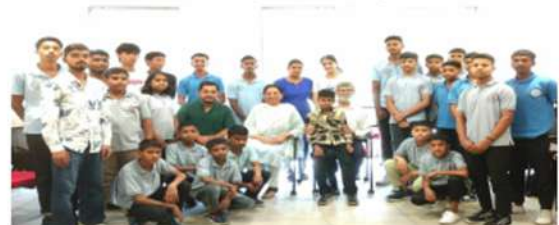
Value Education program for the students of the Arth

Created by VIVA team Digital services by