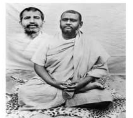
Swami Brahmananda (regarded as the spiritual son of Ramakrishna Paramahansa)

When Rakhhal’s newly wed wife came to visit Dakshineswar, Sri Ramakrishna asked the Holy Mother to welcome her daughter in-law by presenting her with a Rupee when she met her – as was the custom. Soon Rakhhal came to live with Sri Ramakrishna in Dakshineswar. Thakur was very careful of Rakhhal’s upbringing. One day he asked Rakhhal, “Why can’t I look at your face today? Have you been telling a lie? Rakhhal remembered that he had indeed jokingly done so. Sri Ramakrishna was also very particular about Rakhhal’s spiritual progress. One day he asked him to massage his feet. When Rakhhal was not very keen, he told him “One gets immediate result of rendering service to a holy man”. A reluctant Rakhhal had just started massaging the feet when he saw a dark-complexioned young girl come running into the room with her anklets jingling. She ran thrice around the cot on which Sri Ramakrishna was resting and then merged into him. Sri Ramakrishna immediately smiled looking at Rakhhal and said “See, didn’t I tell you so?”