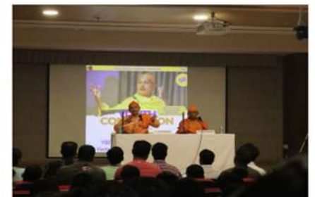
Youth Convention at VIVA