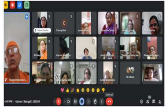
The online Kalyani session in Bengali